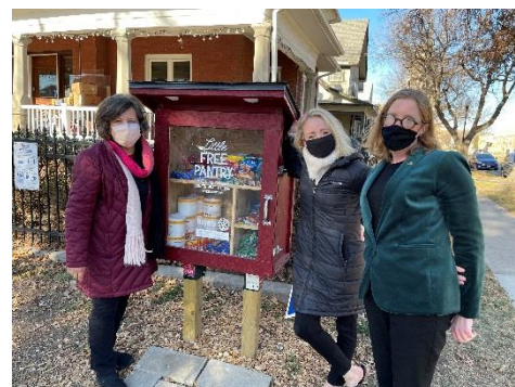
Little Free Pantry