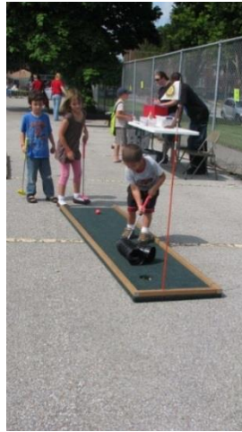
Northeast Family Center

2014-2015 – Veteran’s Resource Center Southeast Community College - $3,000