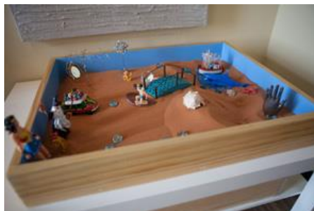
Therapy Sand Tray