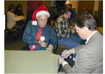
People City Mission

No-Sew / Tied Blankets - bought fabric and made during a club meeting