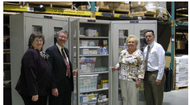
Clinic With A Heart

2008-2009 - Clinic with a Heart - $2,064.34 File Cabinets for Pharmacy – locking, rolling cabinets