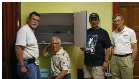
Voices of Hope