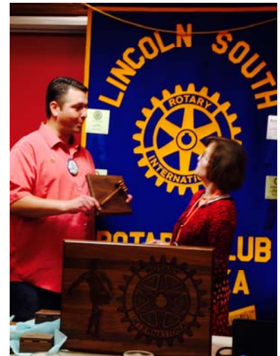
CHANGING OF THE GUARD