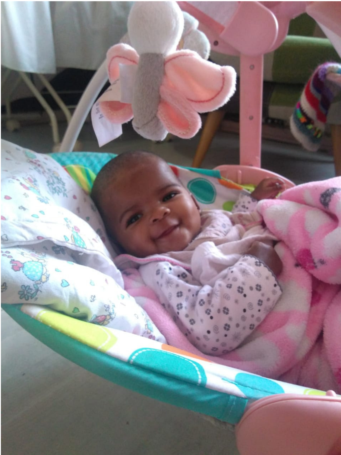
Sporting a new haircut :-)