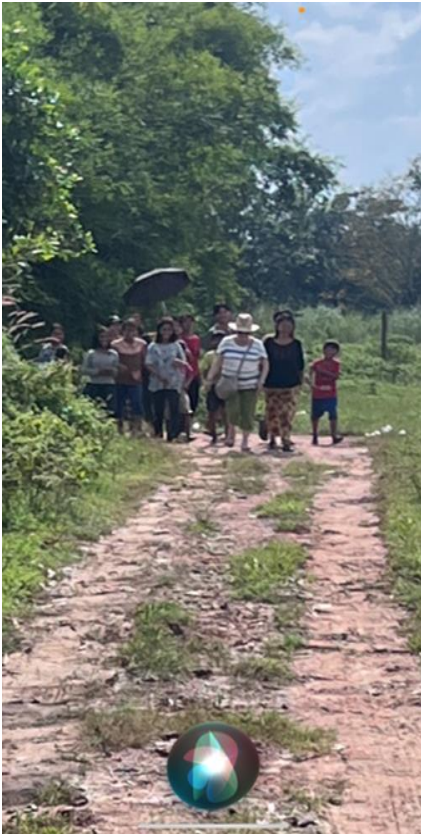
This photo on the left shows the road constructed for the Hope for Myanmar Children Home with funds from the RC Essendon.