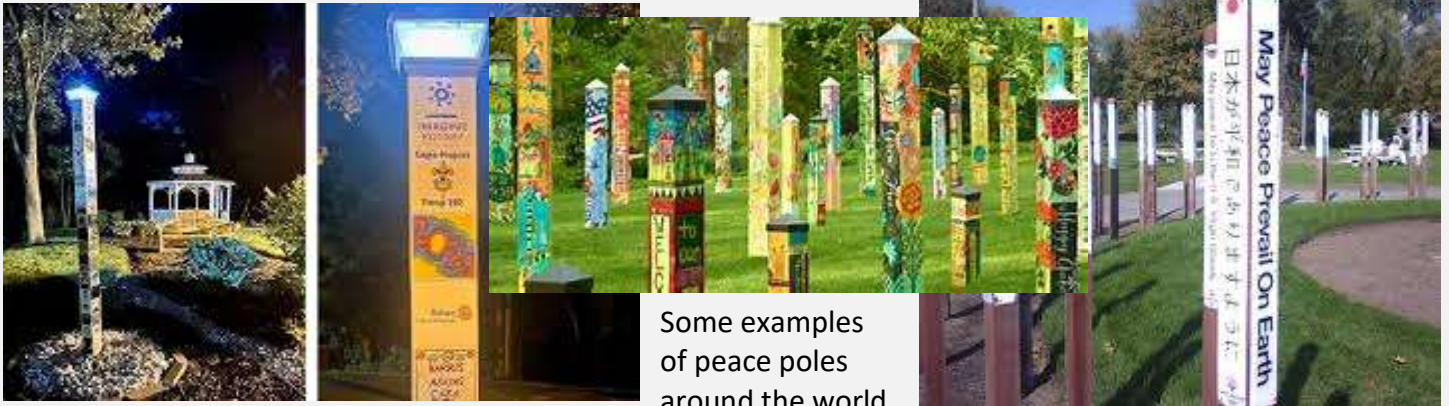
Some examples of peace poles around the world.

If we get a peace pole/s how would you want them to represent our club and our mission? Send in your ideas, including sketches, to the Ed. Need some inspiration? Go to https://rotarypeacepoles.world/