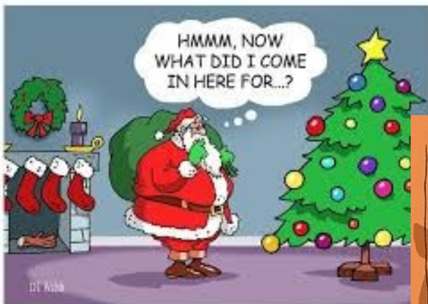
Santa has a senior moment