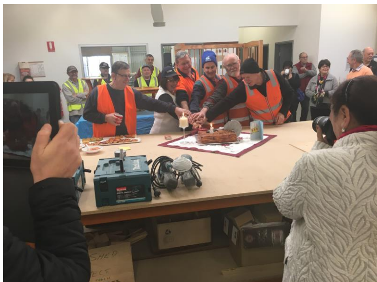
Cutting the birthday cake