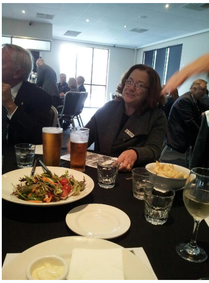
after the third and the fourth she was a bit tipsy, you can see