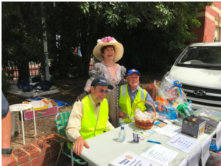
A blast from the past, beautiful!

Well done Community Committee And thanks to all involved