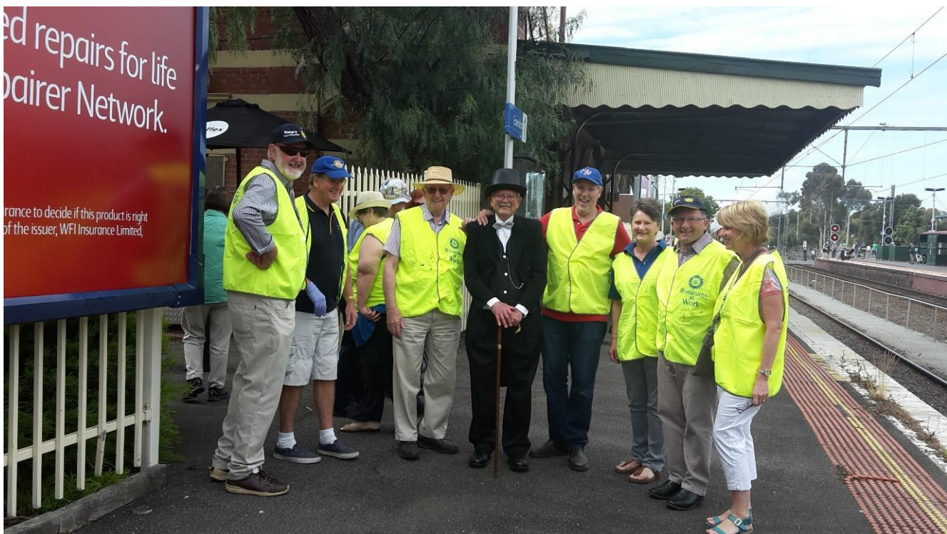
First class traveller with the railway workers