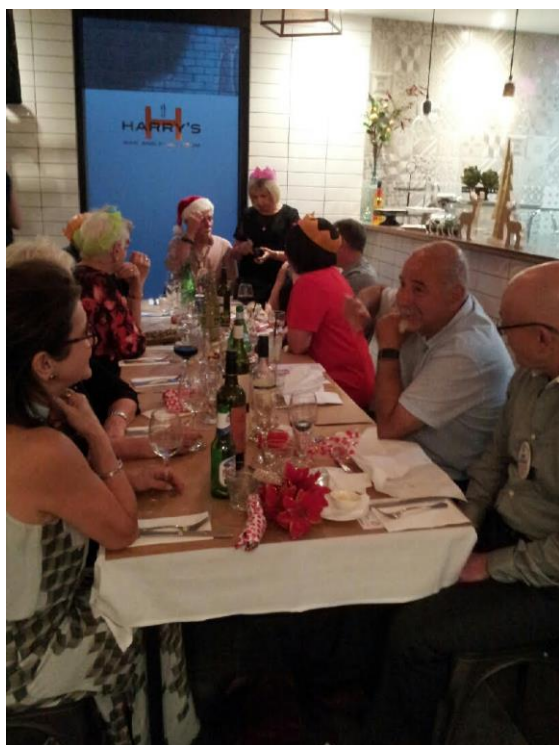
Sicilians planning their next move?