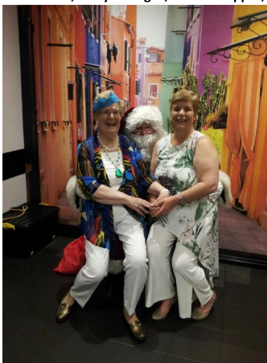
Jennifer Lawrence on right with friend