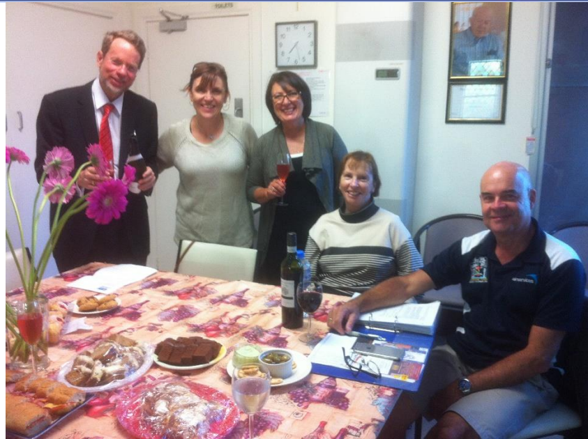
International Committee Valentines day meeting