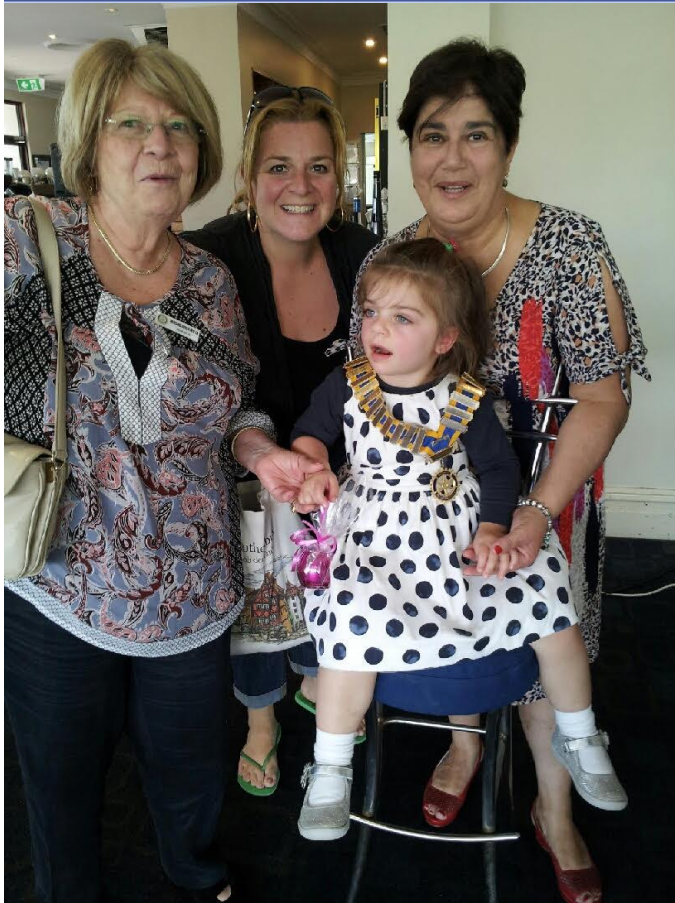
President elect of the Rotary Club of Essendon!!!