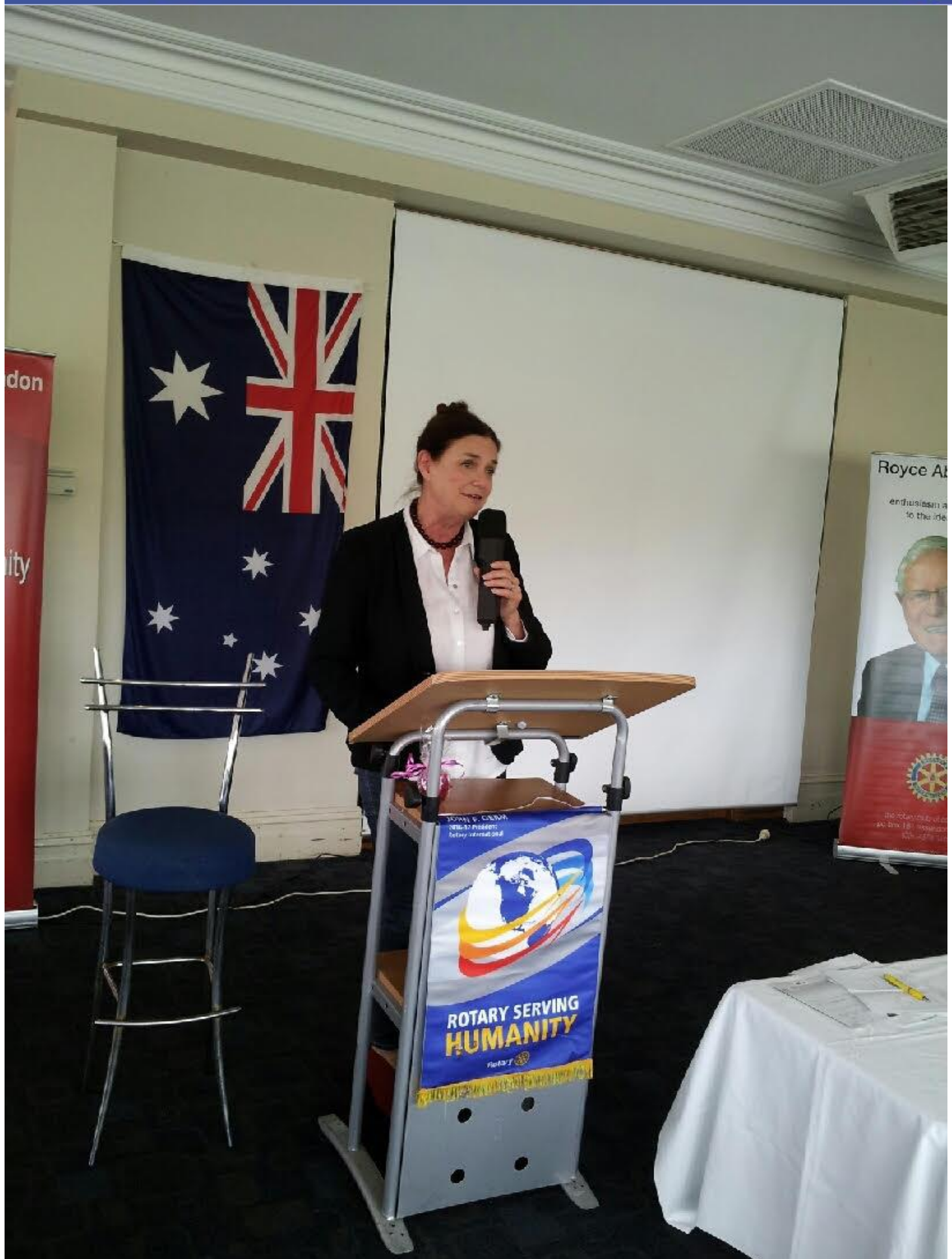
Guest Speaker Hannie Rayson