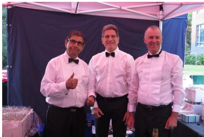
The Three Tenors