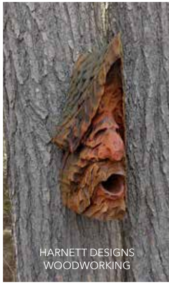
HARNETT DESIGNS WOODWORKING