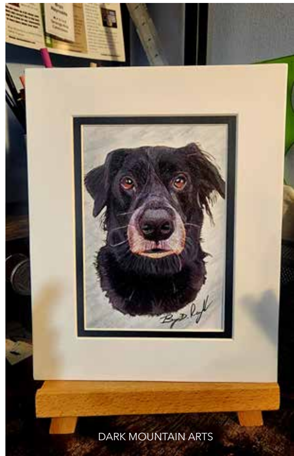
DARK MOUNTAIN ARTS