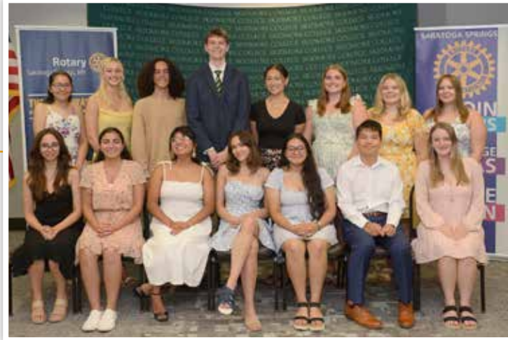
The Saratoga Springs Rotary Education Foundation honored high school seniors with $100,000 in college scholarships in 2024.