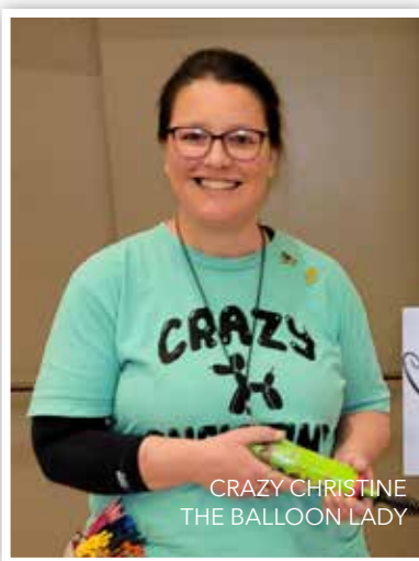
CRAZY CHRISTINE THE BALLOON LADY