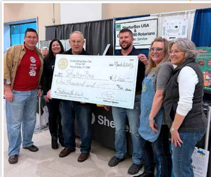
Rotary Club of Saratoga Springs donating $1,000 to ShelterBox USA. Photo provided.

You may also get general information at the Rotary booth on the main floor of the Home & Lifestyle Show.