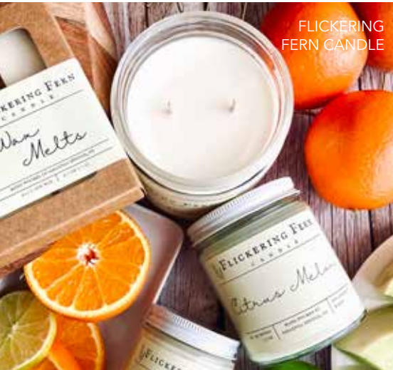
FLICKERING FERN CANDLE