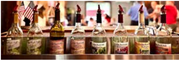
LEDGE ROCK HILL WINERY