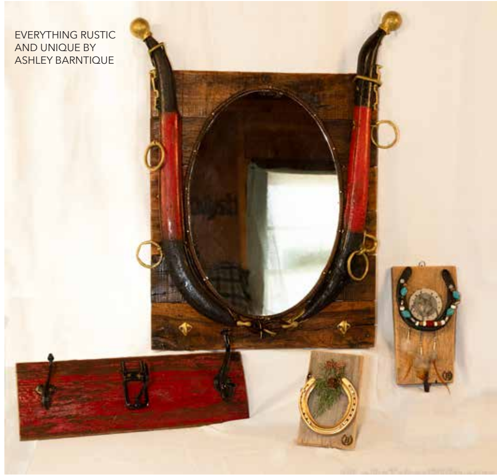
EVERYTHING RUSTIC AND UNIQUE BY ASHLEY BARNTIQUE