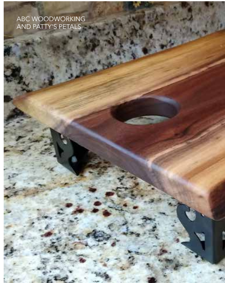
ABC WOODWORKING AND PATTY'S PETALS