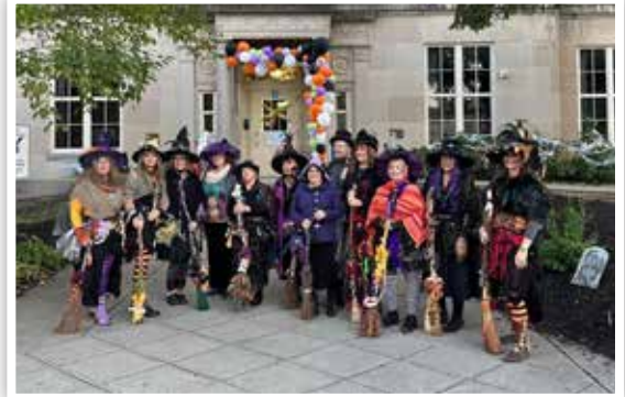
Witch Walk SoSa. Photos provided.