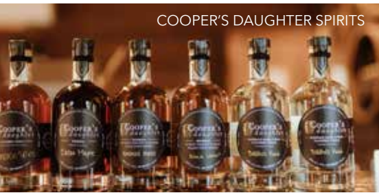
COOPER'S DAUGHTER SPIRITS