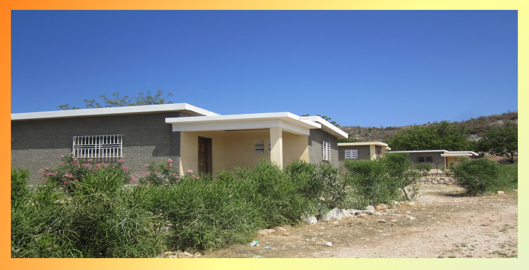
The deed for each house and the land will be given to the homeowner at the end of 10 to 15 years. Picture of a completed house.