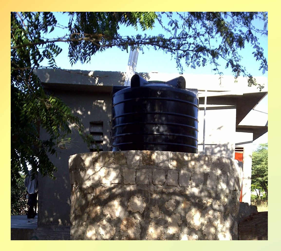
When the cisterns were replaced the residents built a strong base in cement to prevent them for falling.