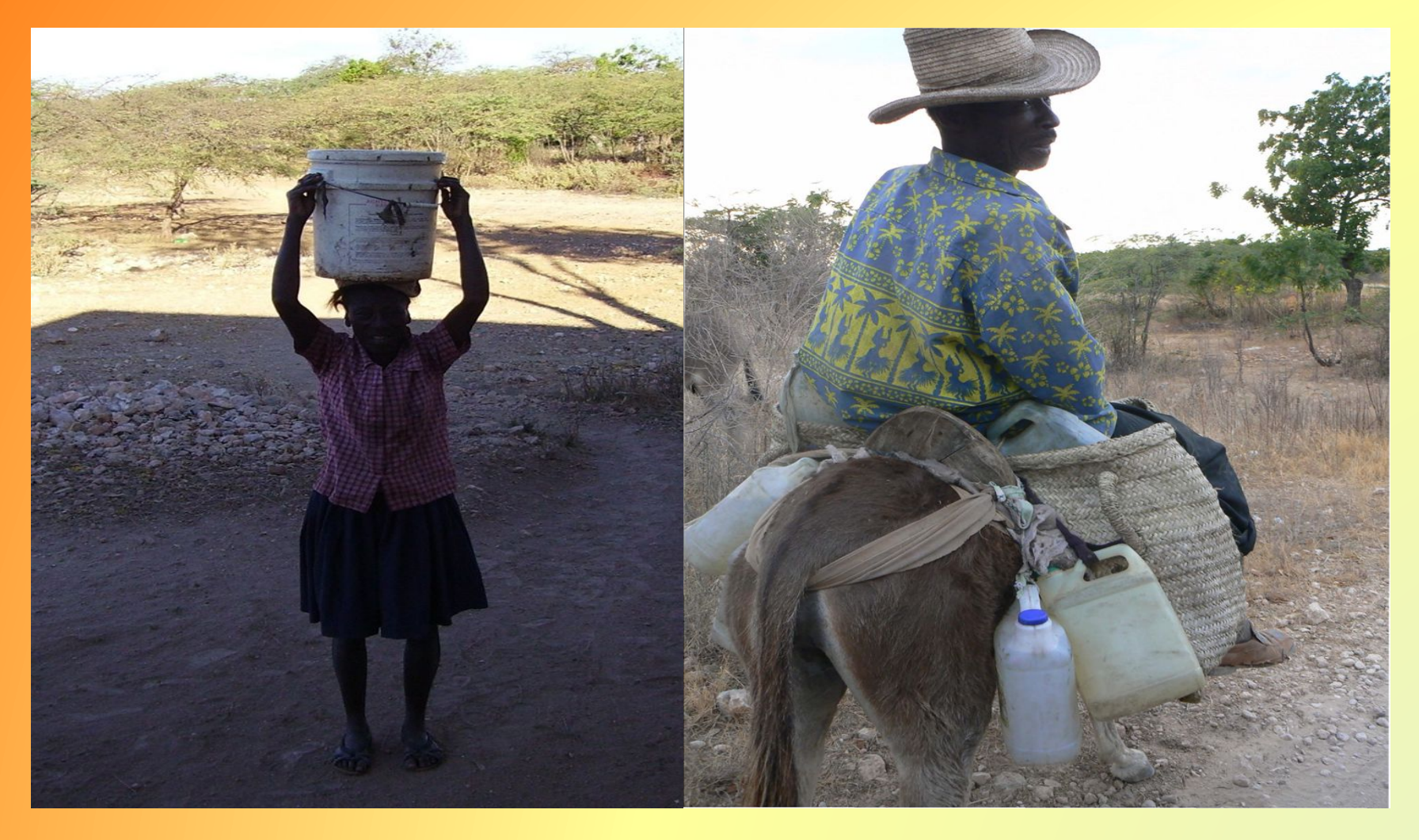
There is no water in the village. The residents have to bring water from far away to meet their daily needs. We are exploring the possibility of digging a well.