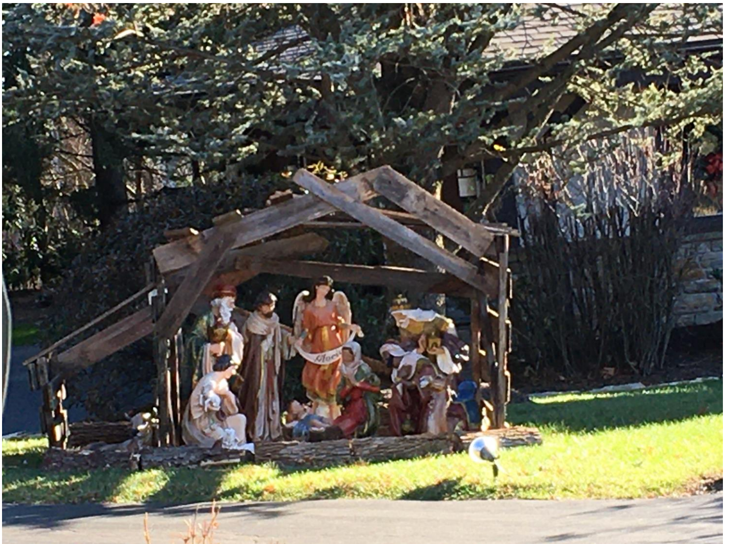
This lovingly created Christmas Decoration is displayed at a residence in Wyndham Hills

Wishing you and all your loved ones a very happy Holiday Season filled with laughter and joy