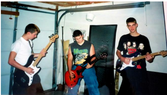
THE GARAGE BAND