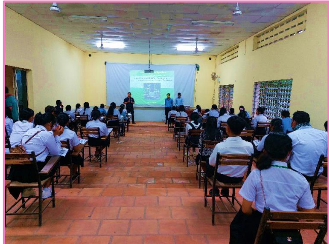
The school presentation.

Going there reminded us of all about life as Cambodians that are dependent upon Agriculture for living. Students could feel that these products come from their own hands.