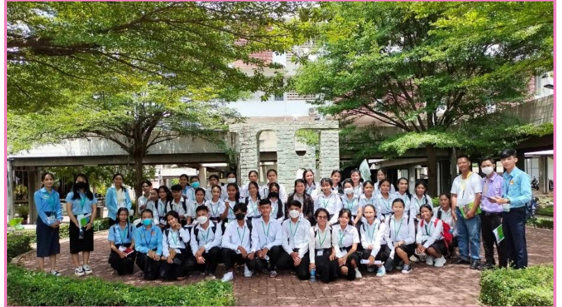
Participated in the University's presentation