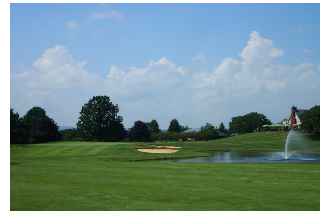
Brookside Country Club Macungie, PA