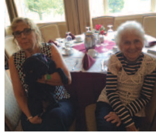
SEEING EYE DOG DONATION