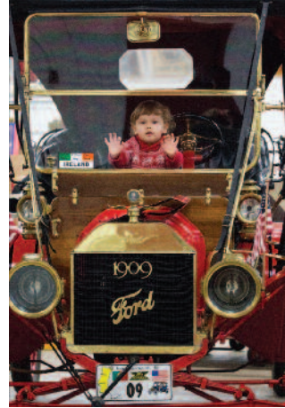
LICENSED FOR CUTENESS