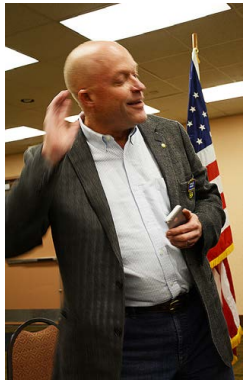
PP Cy hearing "None"

(meaning nominations from the floor") closed the election of officers.