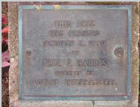
The Plaque Located Under the Tree

"THIS TREE WAS PLANTED OCTOBER 2, 1939 BY PAUL P. HARRIS FOUNDER OF ROTARY INTERNATIONAL"