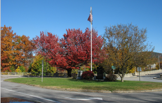
Rumford's Rotary with the former Paul Harris Tree in Full Red Autumn Color