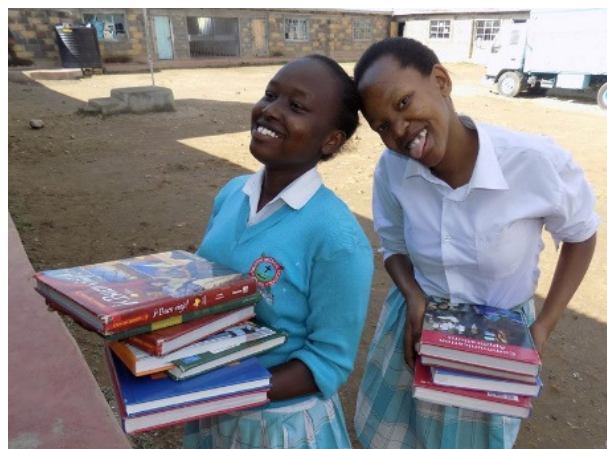
Students in Kenya with books from the Books for the World recent delivery.