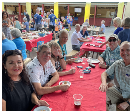
Club members, family and friends gathered at the Capital Brewery for a pot luck party on August 26 at which the club's annual awards were presented.