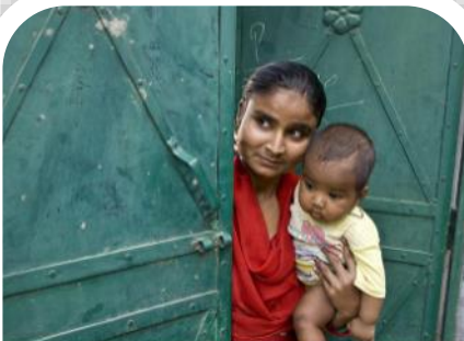
Saving mothers and children