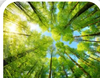
Protecting the environment

Rotary has been working to eradicate polio for over 35 years, and our goal of ridding the earth of this disease is in sight.