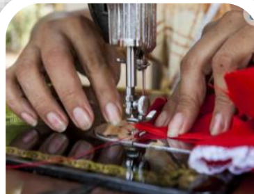
Growing local economies