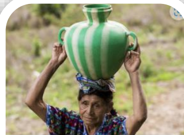
Providing clean water, sanitation, and hygiene