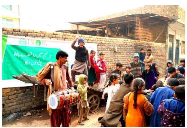
Drumming up business! Local Punjabi drummer attracts kids and parents to polio vaccination clinics.

<u>Next-Generation Oral Vaccine</u>. The recently fielded mutation-resistant oral vaccine, nOPV<sub>2</sub>, has obtained its final World Health Organization regulatory approval. This is the vaccine that should substantially reduce vaccine-derived polio cases, because its weakened virus component is far less likely to mutate into a virulent strain. Although some countries have been using it for over a year, this final ap-