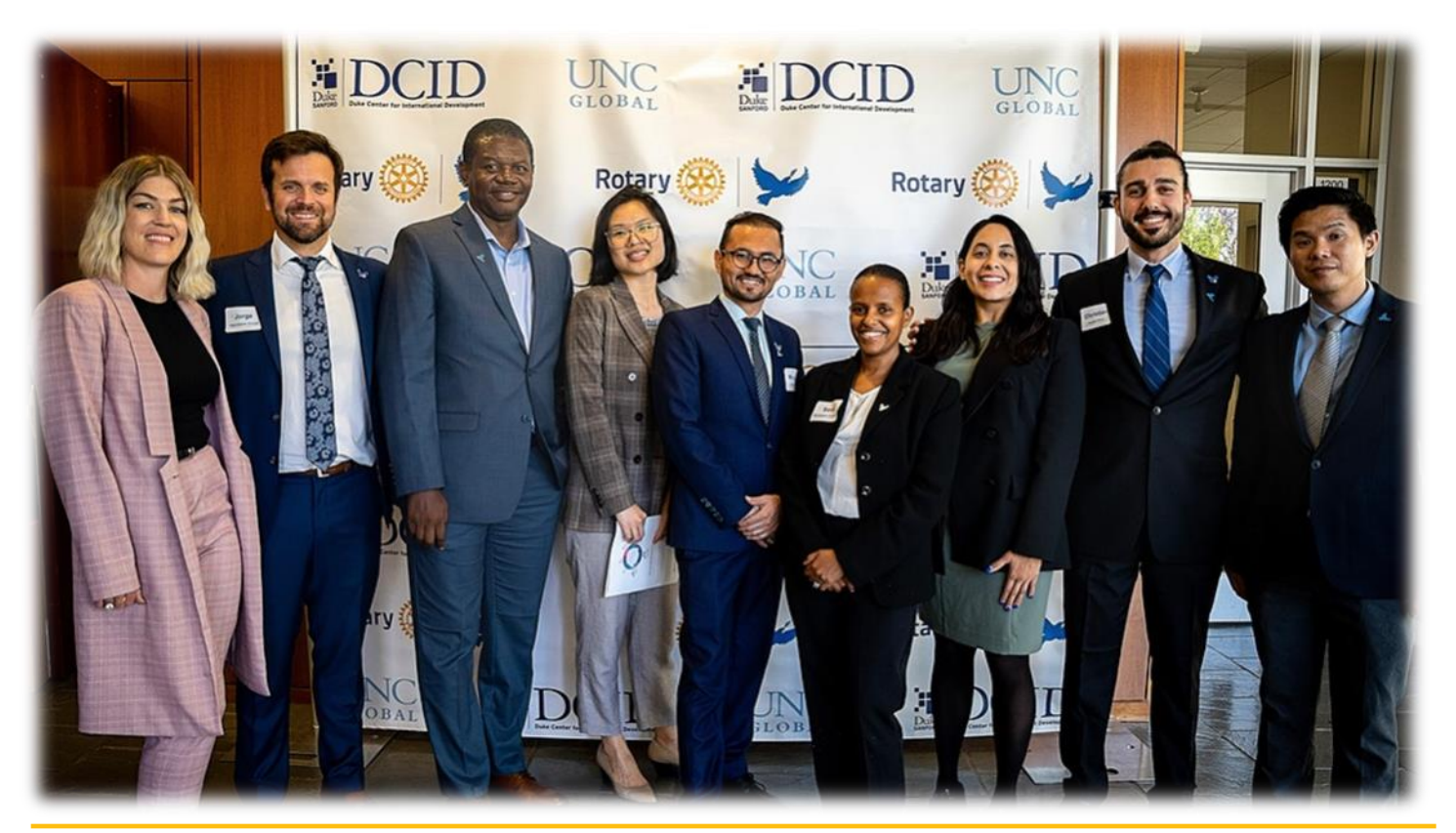
Page 3 In Motion: The Rotary Foundation Newsletter of District 7610