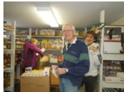
Joyce Uptown Food Shelf