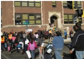
Jefferson Community School