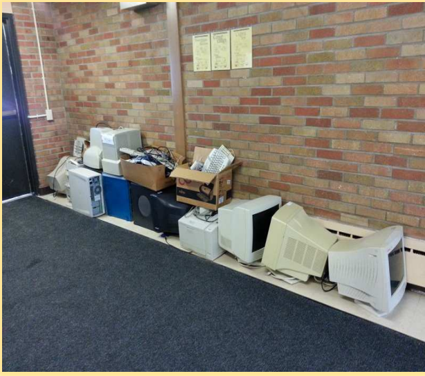
Antiquated equipment ready to be recycled

As a result, the computer lab is updated and classes have begun. It is a dramatic change.