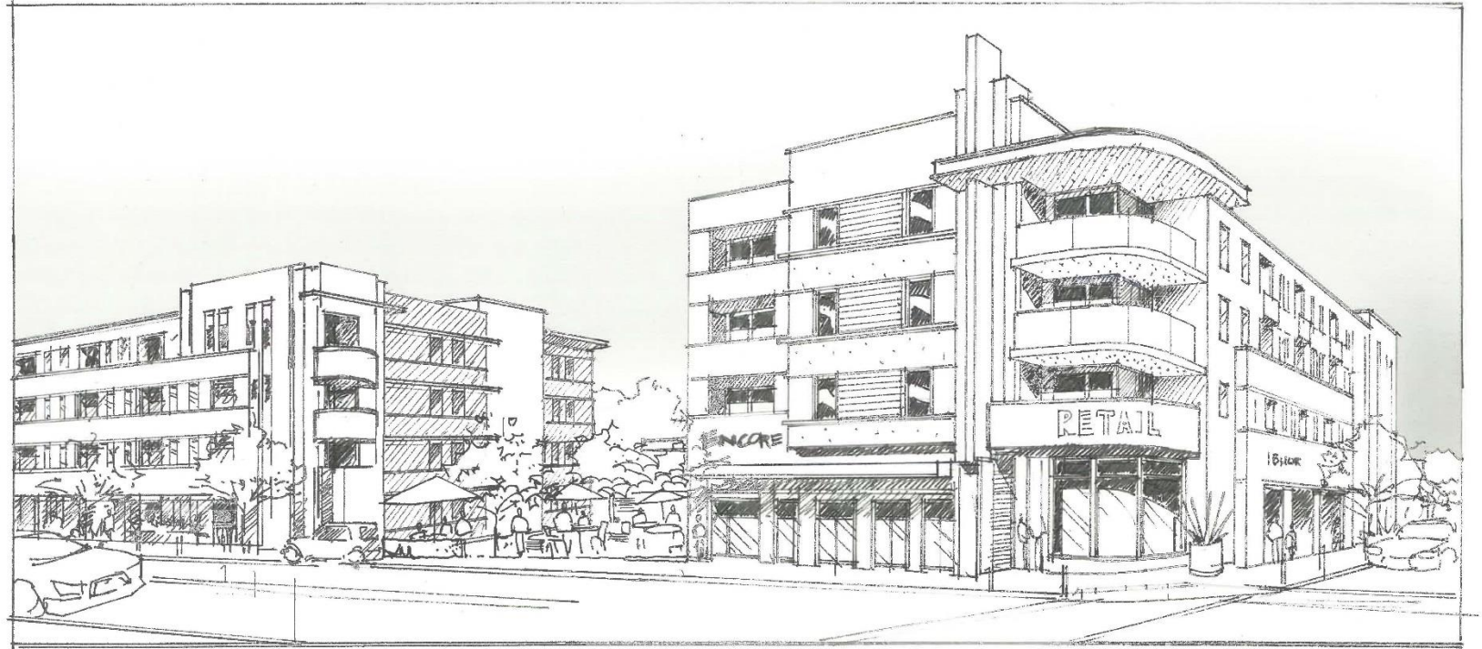
PERSPECTIVE VIEW FROM HESPERIAN BLVD AND PASEO GRANDE