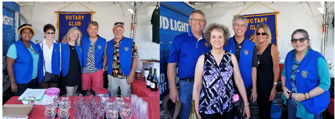
The Rotary Club of Castro Valley banner was prominently displayed on the Main Stage at the Fall Festival.