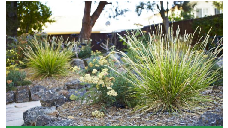
Water & Energy Savings