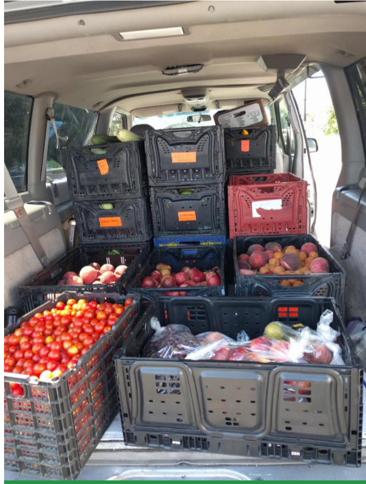
Rescuing edible food