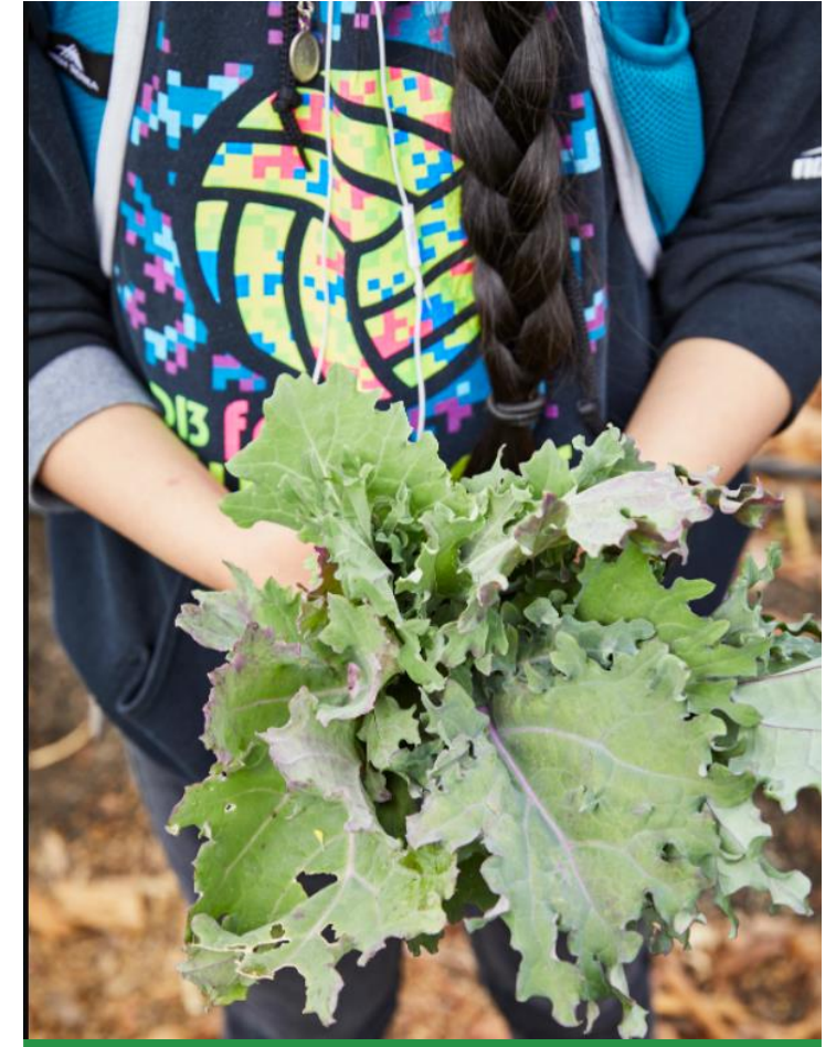
Supporting community organizations & local farms