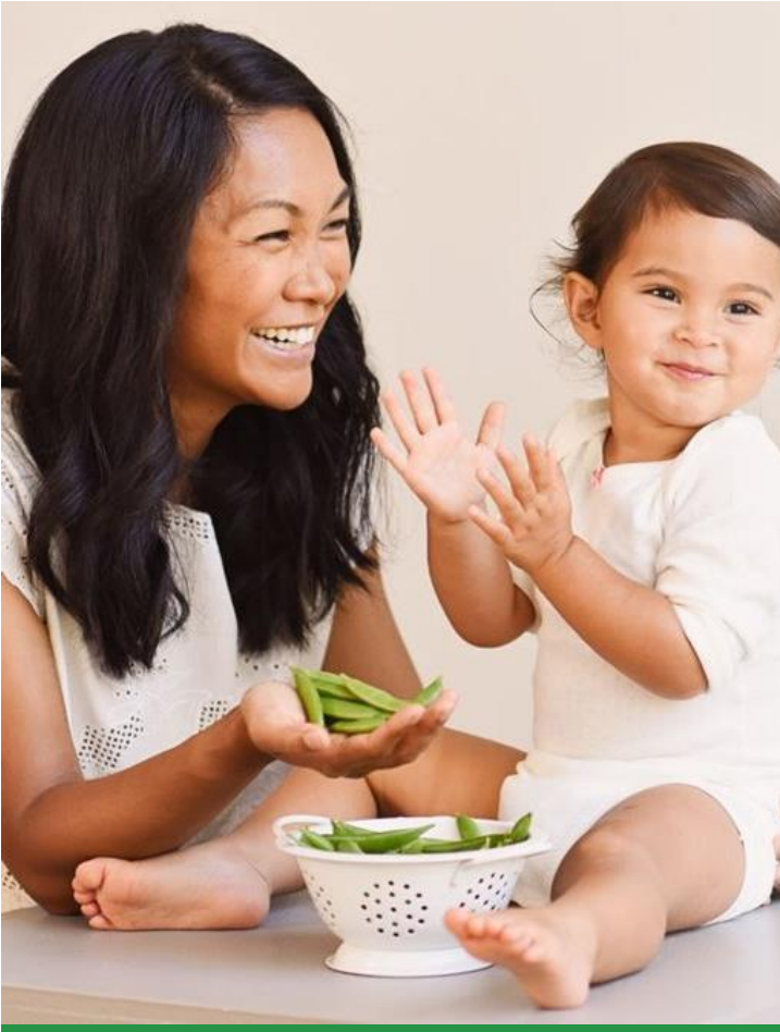
Food waste prevention at home, at school, at work