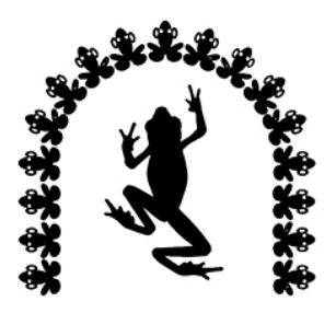
PROYECTO RANA DORADA PROJECT GOLDEN FROG