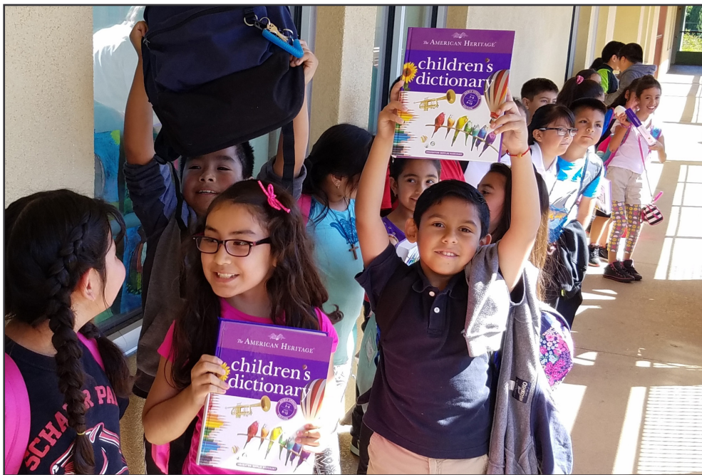
Third graders proudly show off their new dictionaries, gifts from Hayward Rotary Club.