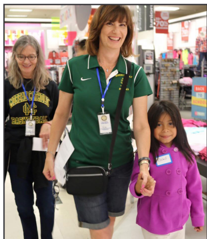
Community volunteers take a child through JCPenney Southland mall during Hayward Rotary Club's Back-to-School "Child Spree" event