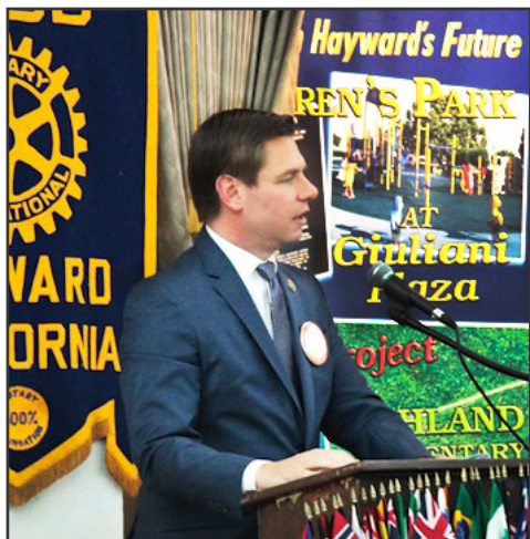
Congressman Eric Swalwell, Hayward Rotary Club member since 2013