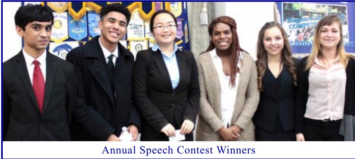
Annual Speech Contest Winners