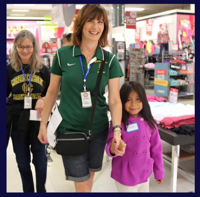
Over 100 volunteers help guide the children through the store and shop for their back-toschool gear. Donations are needed and gladly accepted. The event goal is to raise $100 per child ($10,000 total). To make a tax-deductible donation, please make checks payable to Hayward Rotary Foundation and mail to: Hayward Rotary Foundation, P.O. Box 629, Hayward CA 94543 or visit www.haywardrotary.org

Hayward Rotary Club's annual "Child Spree" back-to-school shopping event provides 100 Hayward children the back-to-school gear they need for the upcoming school year. All 100 participating children have been identified in partnership with the Hayward Police Department Youth and Family Services Bureau. Event sponsored by Hayward Rotary Club Foundation in partnership with JCPenney, Southland Mall, and Friends of Hayward Library.