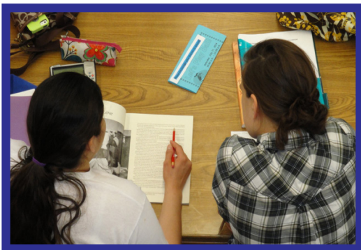
A tutor-learner pair works together in the Hayward Library to achieve the learner's personal literacy goals.