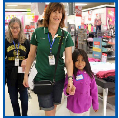
Volunteers had a great time helping kids shop for their back-to-school gear during the 2015 Child Spree back-to-school shopping event.