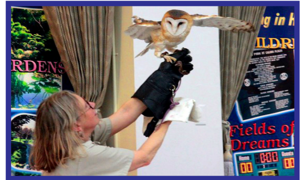
This Barn Owl cannot be released into the wild because of a broken wing. He lives at the Sulphur Creek Nature Center full time and helps educate others about wildlife conservation. Barn Owls are known for their superior hearing and their ability to fly in absolute silence, which allows them to detect and surprise their prey.