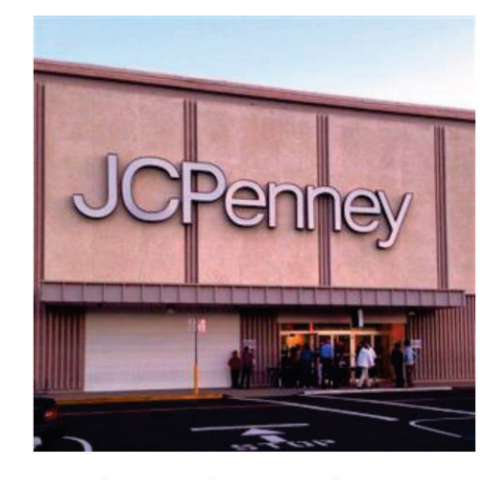
Contact: George Pacheco