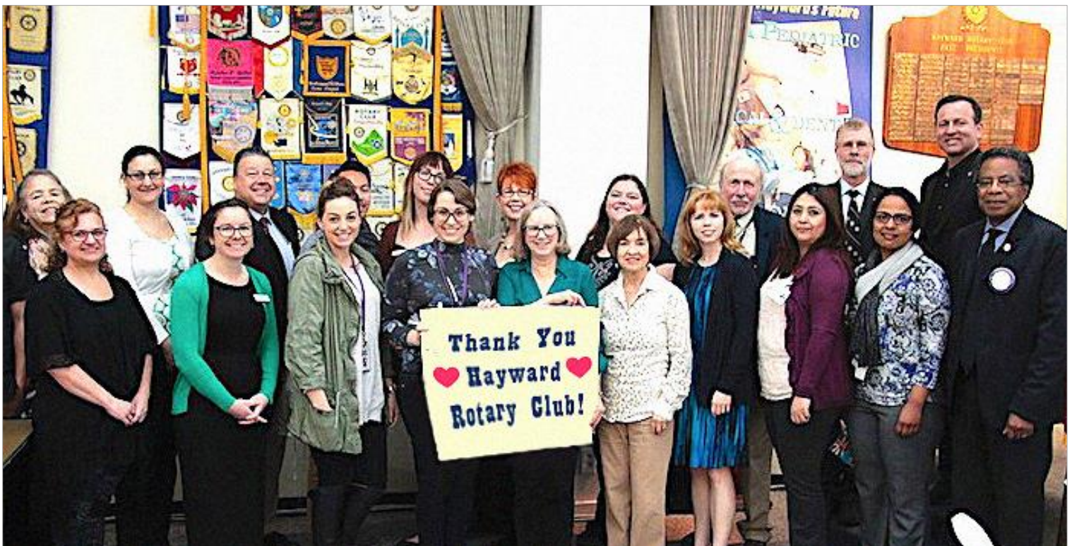
Hayward Rotary Club proudly presented Community Grant Awards to eleven local charitable nonprofit organizations in 2017.