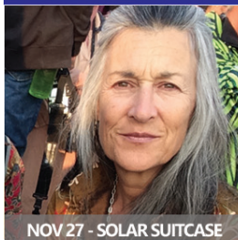
NOV 27 - SOLAR SUITCASE