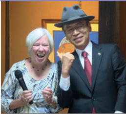
NOV 6 - HAYWARD SISTER CITY