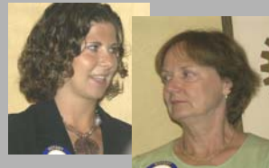
EAST PALO ALTO TENNIS