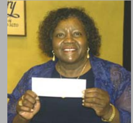
EUMENICAL HUNGER PROJECT