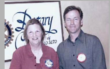
MUSIC IN THE SCHOOLS FOUNDATION