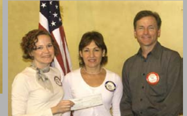
YOUTH & FAMILY ENRICHMENT SERVICES