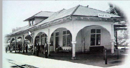
Palo Alto Train Station

Palo Alto University: Sheraton Hotel, El Camino, Palo Alto, 07:15