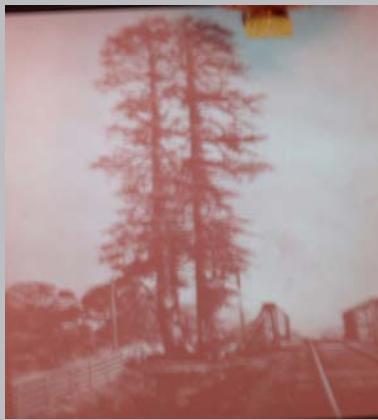
El Palo Alto