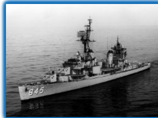
Geoff Ball US Navy