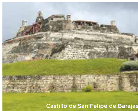
Castillo de San Felipe de Barajas