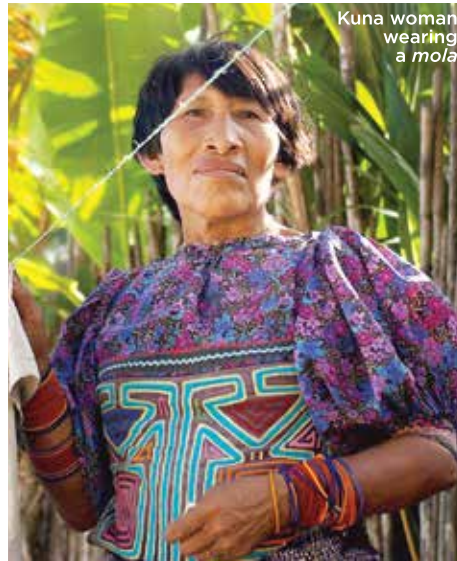
Kuna woman wearing a mola

Cartagena was founded in 1533 by Spanish maritime explorer Pedro de Heredia. Spend a full day exploring this colonial walled city and the Casillo de San Felipe de Barajas, a UNESCO World Heritage site and a superb example of Spanish military engineering. Las Bóvedas, structures built into the walls of the old city as storage vaults, were used as dungeons during the civil wars of the 19th century and now house shops and boutiques offering traditional Colombian handicrafts. Celebrate your journey at a farewell reception and dinner. HEBRIDEAN SKY (B,L,R,D)