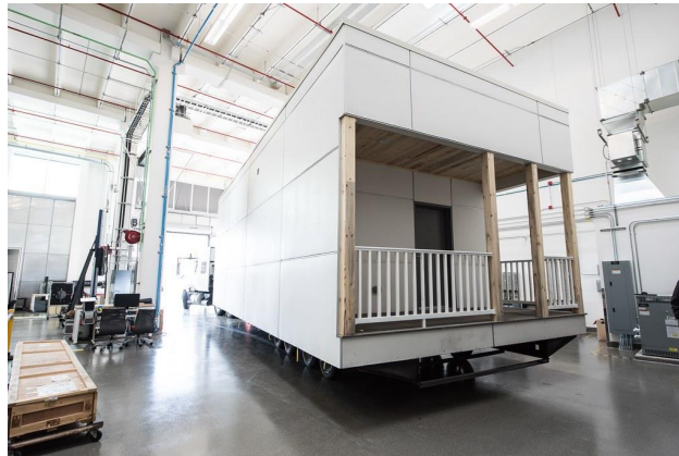
2 - (similar facility)

The Habitat for Humanity Modular Building Facility,