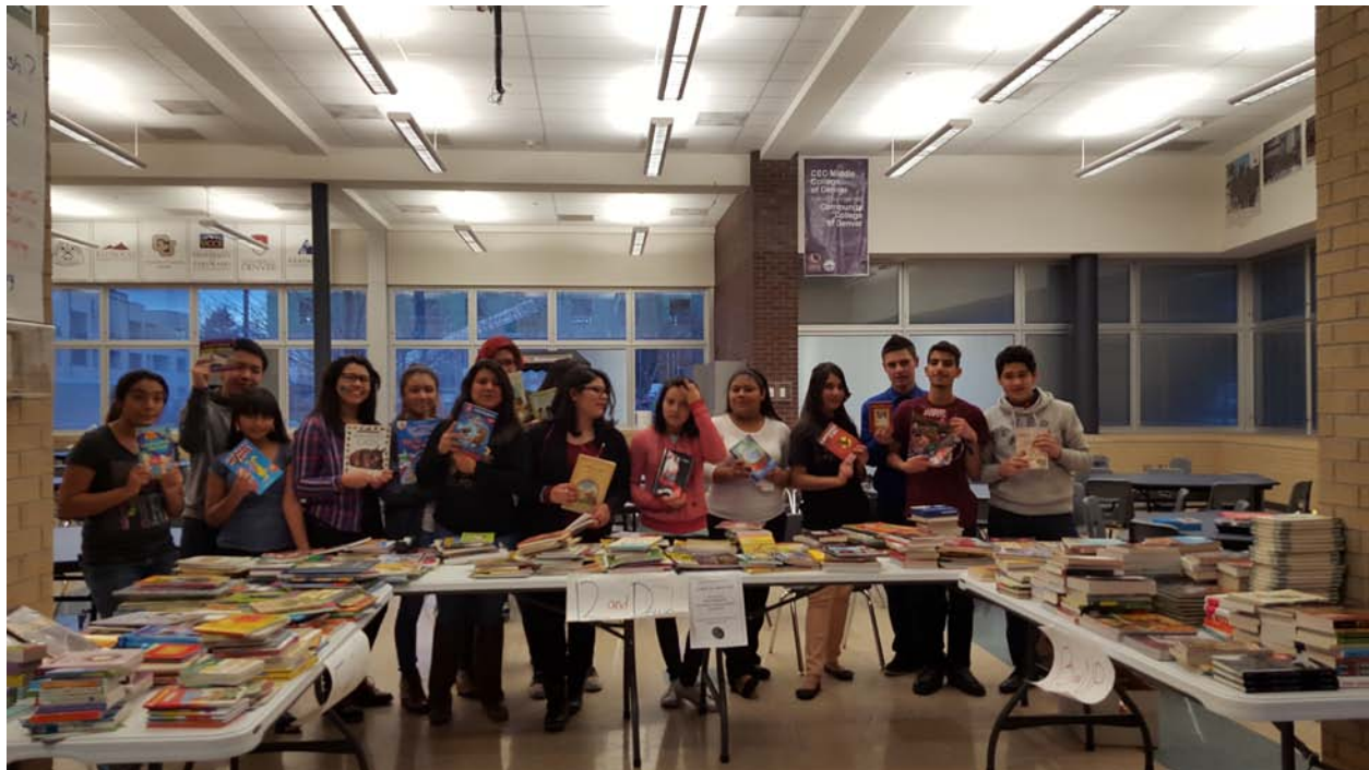
CEC Interactors Prepare Children's Books for Give Away to CEC Families

CEC Interactors obtained children's books from DMHR and distributed them to CEC families to give as Christmas presents. They researched where to distribute leftover books, and selected a Denver agency that serves families. (December)