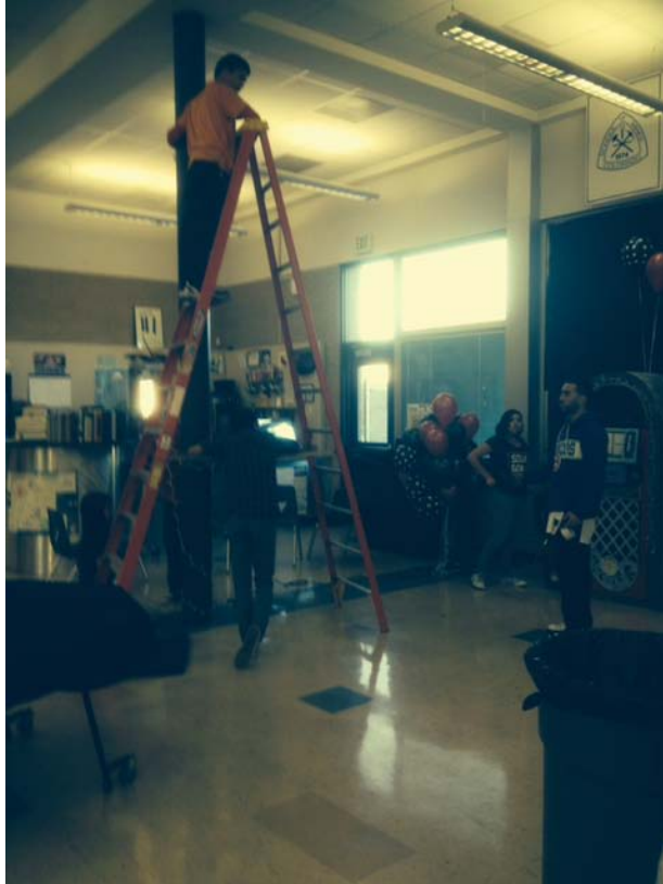
Decorating for Valentine's Dance set up