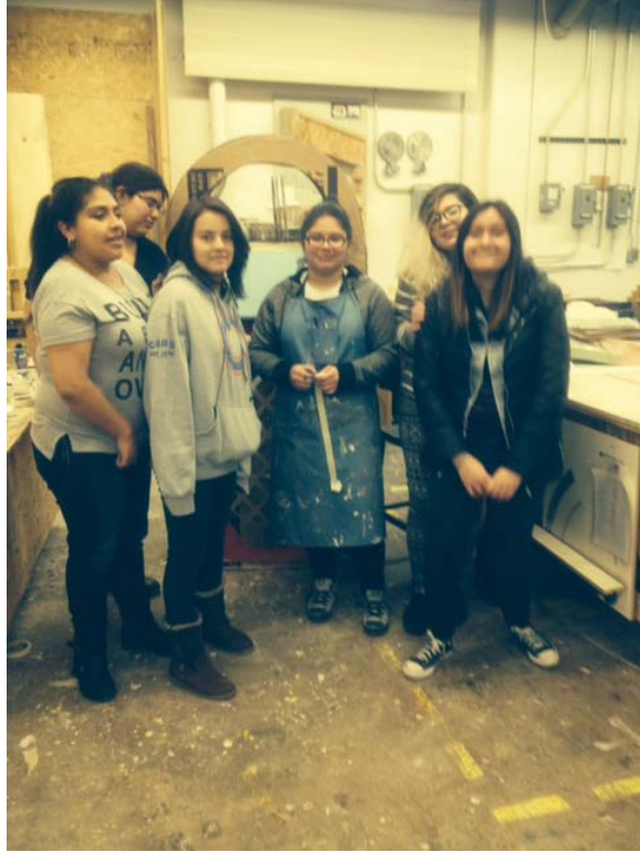
CEC Interactors Building Jukebox for Valentine's Dance