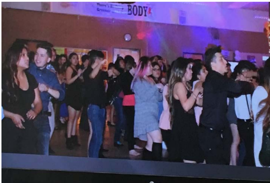
CEC Interact Club's Valentine's Dance Raises $600 for Thirst Project!