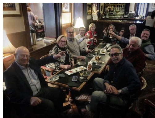
April monthly Happy Hour!